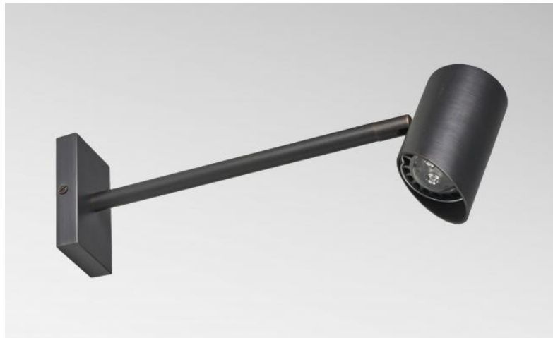
PALMA in brushed bronze