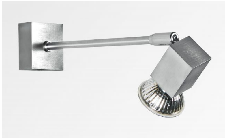
PEGASE in brushed chrome